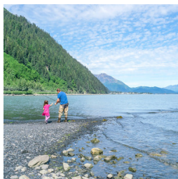
Boating & Fishing Foundation