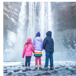
The North Face