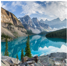
Family Traveller Magazine